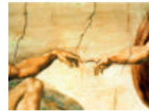
CREATION OF ADAM