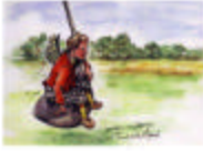
MY GOLF SWING ANGEL