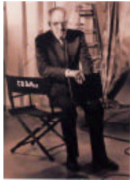
CECIL B. DEMILLE