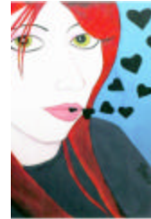
HOW DO I LOVE THEE?