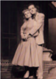
DIARY OF A JUVENILE