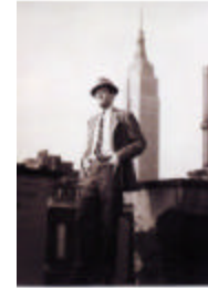
NEW YORK, NEW YORK