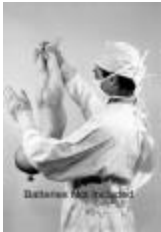
BATTERIES NOT INCLUDED