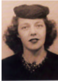
MY MOTHER'S PURSE