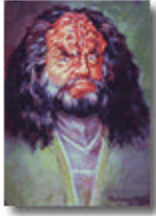
L'KOR