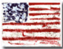
LIVE FREE OR DIE