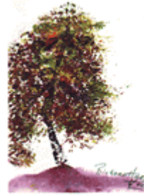
BERKSHIRE TREE